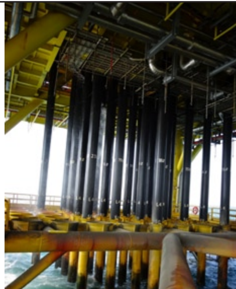
Riser pipes (black) after 10 months of operation