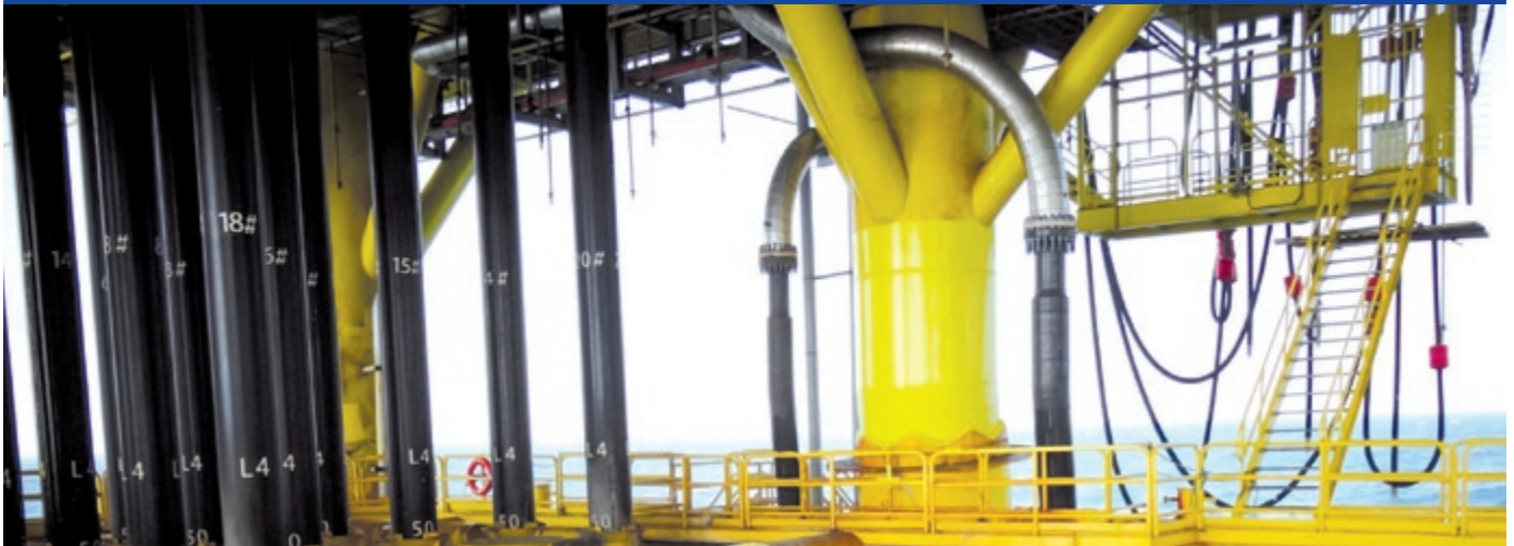
Riser pipes (black) after 10 months of operation