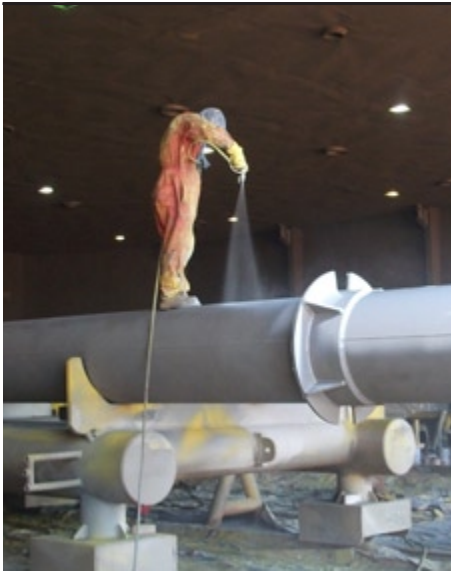
Application of the first layer - in grey color

Ceramic-Polymer SF/LF-SRB in grey (RAL 7035) and black (RAL 9005) color