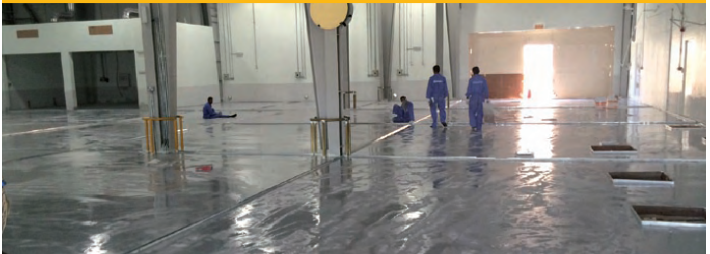
Applied coating in the car workshop