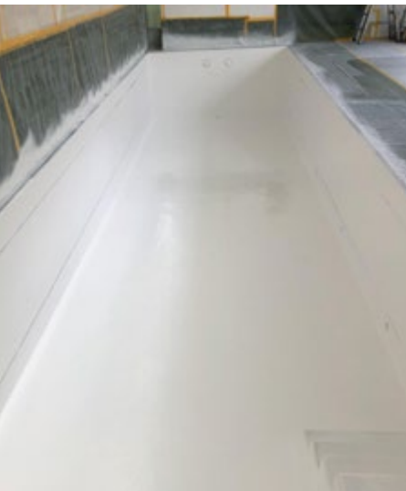
PROGUARD CN 200 in white color as 2nd coating layer facilitates a high-quality look of the pool.