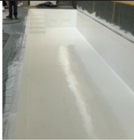
First coat of our product PROGUARD CN 200 in lightgrey, applied by airless spraying method.