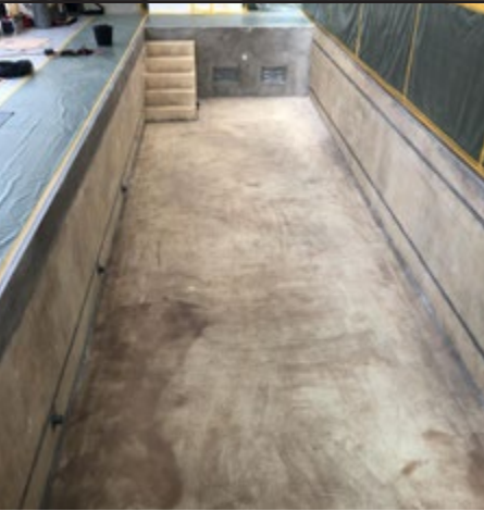
The grinded concrete is primed with CP-Synthofloor BETA 8016 and scattered with quartz sand.